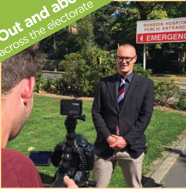
David filming a video to draw attention to the urgent need for the Government to commit to upgrading Dunedin Hospital.