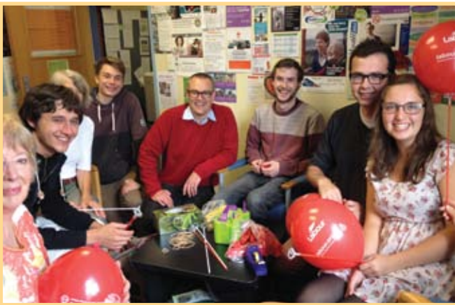
Blowing up balloons with volunteers for the Thieves Alley Octagon Market Day.